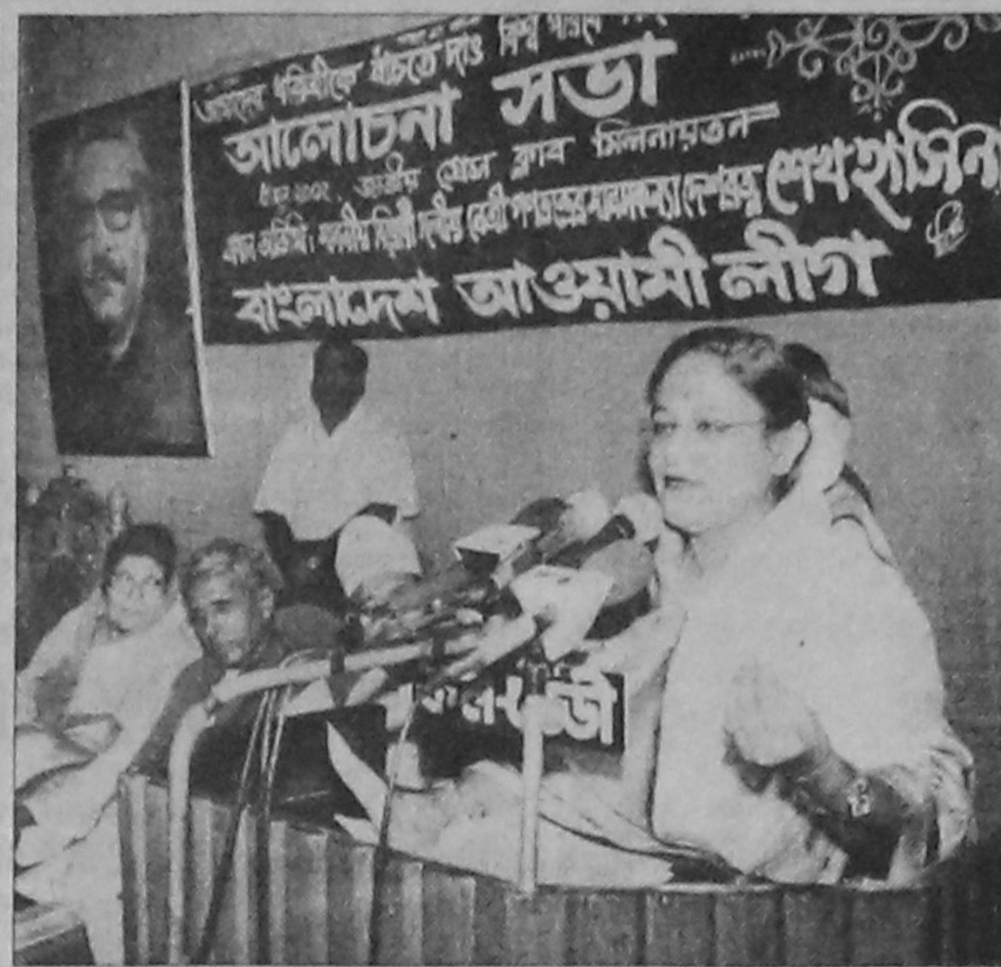
Awami League president and Leader of the Opposition in Parliament Sheikh Hasina speaking at a discussion marking the World Environment Day at the National Press Club in the city yesterday. The Awami League organised the discussion.

Senior naval officers and a large number of BN personnel were present on the occasion, says an ISPR press release.