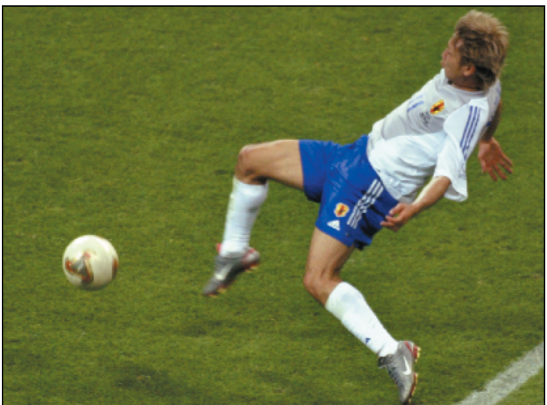
IRREPRESSIBLE SUZUKI: Japan's Takayuki Suzuki about to score his team's first goal against Belgium at Saitama yesterday.