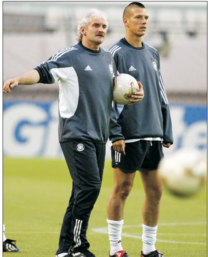
THIS IS MY BALL! Germany coach Rudi Voeller (L) carries a ball while midfielder Christian Ziege looks on during practice at Ibaraki yesterday.