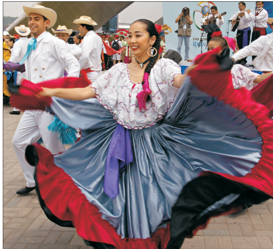
OLE LATINO: Some Costa Rica supporters perform their traditional dance at Gwangju yesterday before the start of the match against China.