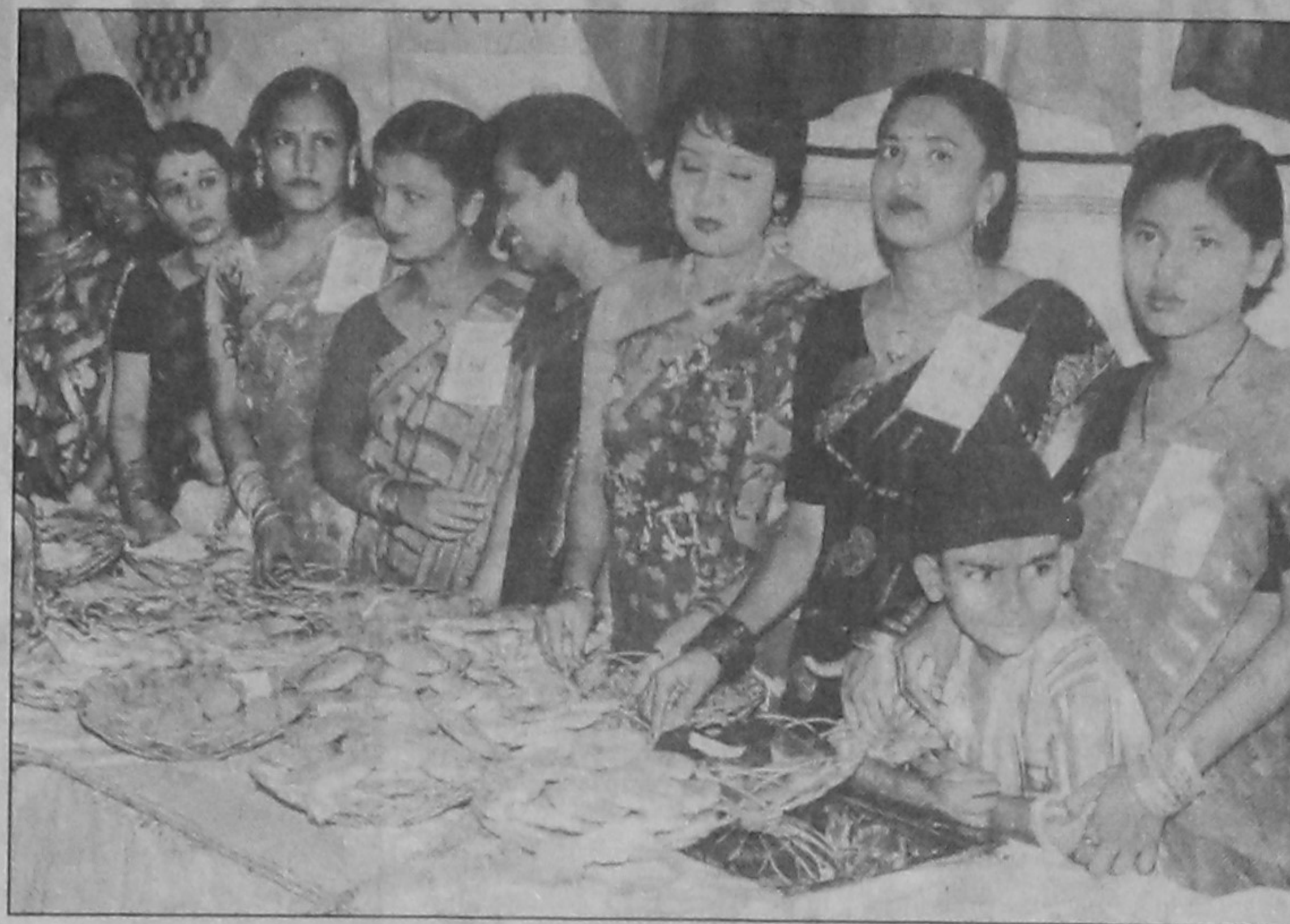
The Dhakabasi organised an exhibition of Bakarkhani (thin-flattened bread) and kites at the National Sports Council auditorium in the city yesterday.

The flag meeting was held at the Company Commander level, BDR sources said.