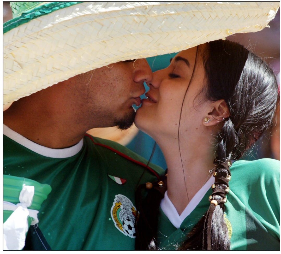
TEQUILA TAKE-OFF! Two Mexican youngsters share an intimate moment during their team's Group G match against Croatia at Niigata yesterday.

and white ribbons attached. The more sober Christian Ziege of Germany looked particularly menacing with his mohican cut, a look made famous by Hollywood star Robert De Niro in the classic movie 'Taxi Driver'. Cameroon coach Winfried Schafer meanwhile, has his blond hair in a striking bouffant style. And there are still some impressively-credentialed entrants to enter the World Cup coiffure contest. South Korea's Kim Byung-il, renowned for his ever-changing hairstyle and somewhat erratic goalkeeping, is probably favourite for the overall title as he has made some startling tonsorial statements in his career. Teammate Ahn Jung-hwan, a pin up for millions of Korean girls, could also surprise by taking the field with a new style to please SEE PAGE 15 COL 1