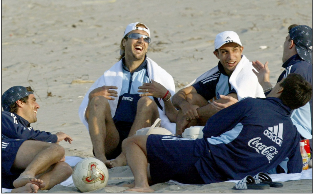
SO RELAXED ALREADY? Argentine national team players (L-R) Roberto Bonano, Gabriel Batistuta, Gustavo Lopez, Pablo Cavallero share a light moment during a period of relaxation at Iwasawa beach in Japan yesterday.