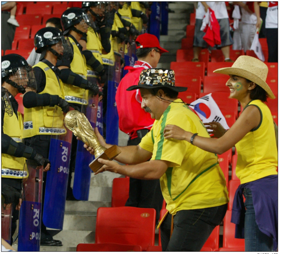
WE'LL TAKE THE REAL ONE, YOU CAN HAVE THIS! A Brazilian fan offers a replica of the World Cup trophy to Korean security policemen ahead of the World Cup Group C game between Brazil and Turkey at Ulsan yesterday.