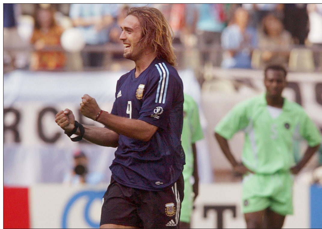
BRAVO BATIGOL: Argentina ace Gabriel Batistuta celebrates after scoring the winner against Nigeria at Ibaraki yesterday.