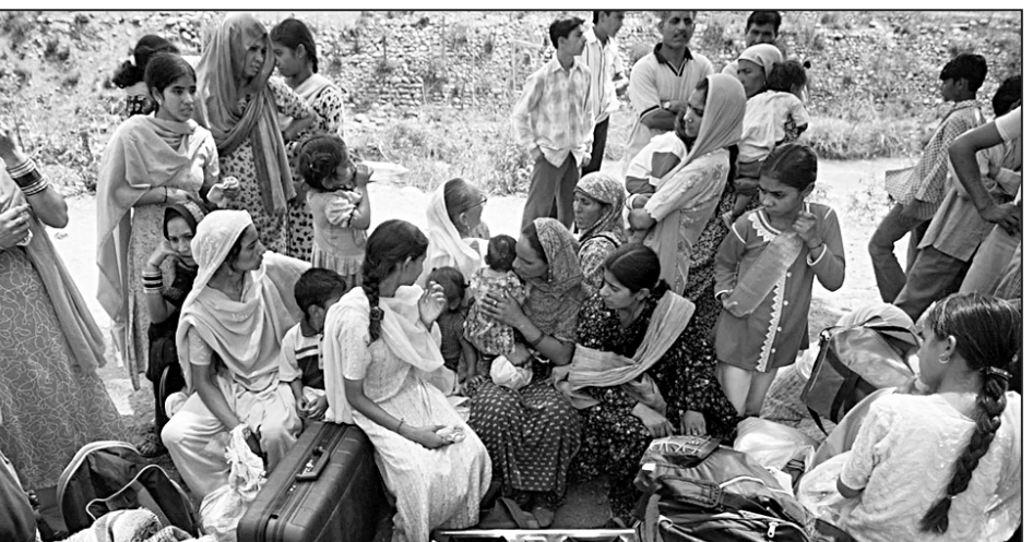
Villagers from Gakriyal fleeing their home wait on the roadside on Sunday at the Akhnoor army post, 30 km west of Jammu. The residents are leaving their village close to the Line of Control, the de facto border with Pakistan, after a woman from their village was killed and six other people critically injured when a Pakistani shell hit a bus.

on Sunday before flying to Saudi Arabia on the latest leg of his regional tour.