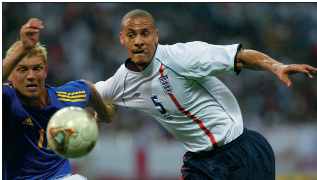
England's defender Rio Ferdinand (R) focuses on the ball, tackling Sweden's forward Henrik Larsson during match 5 group F of the World Cup in Saitama, Japan yesterday.

One page supplement on 'Dutch Bangla Bank' on Page 5 and a four-page supplement in colour on 'the occasion of Queen's Birthday' on Pages 17 to 20