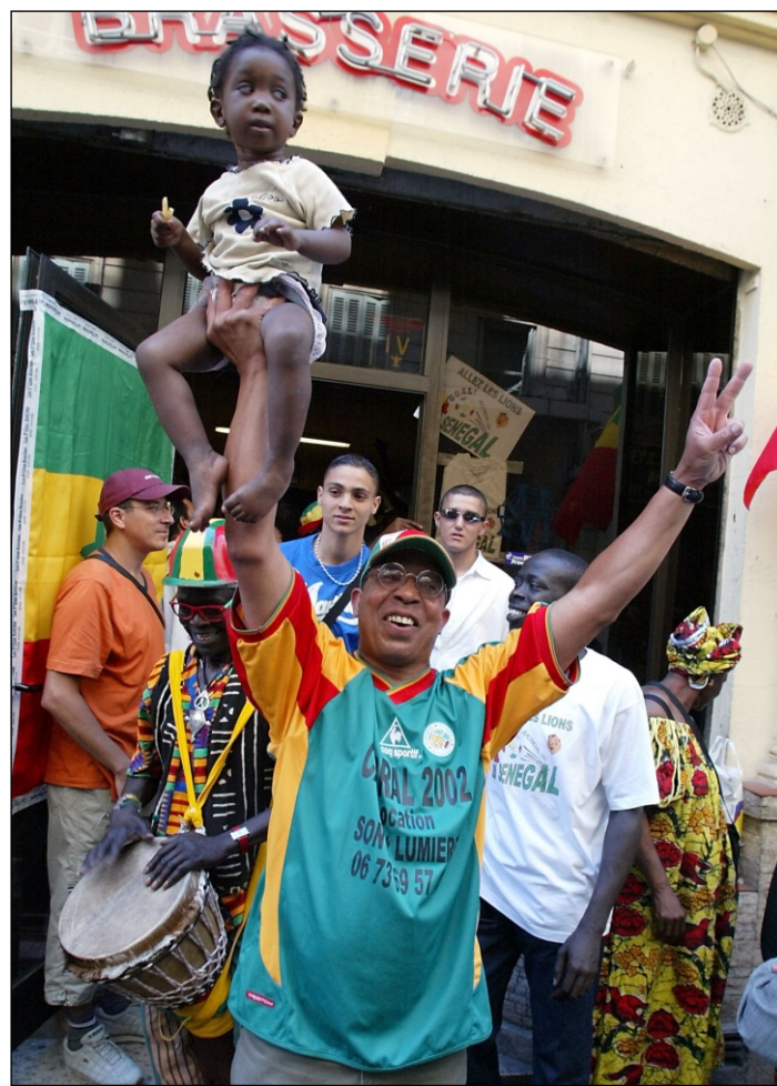
HEY PUT ME DOWN! An elated Senegal national picks his baby up in one hand while celebrating the victory over France at Marseille on May 31.