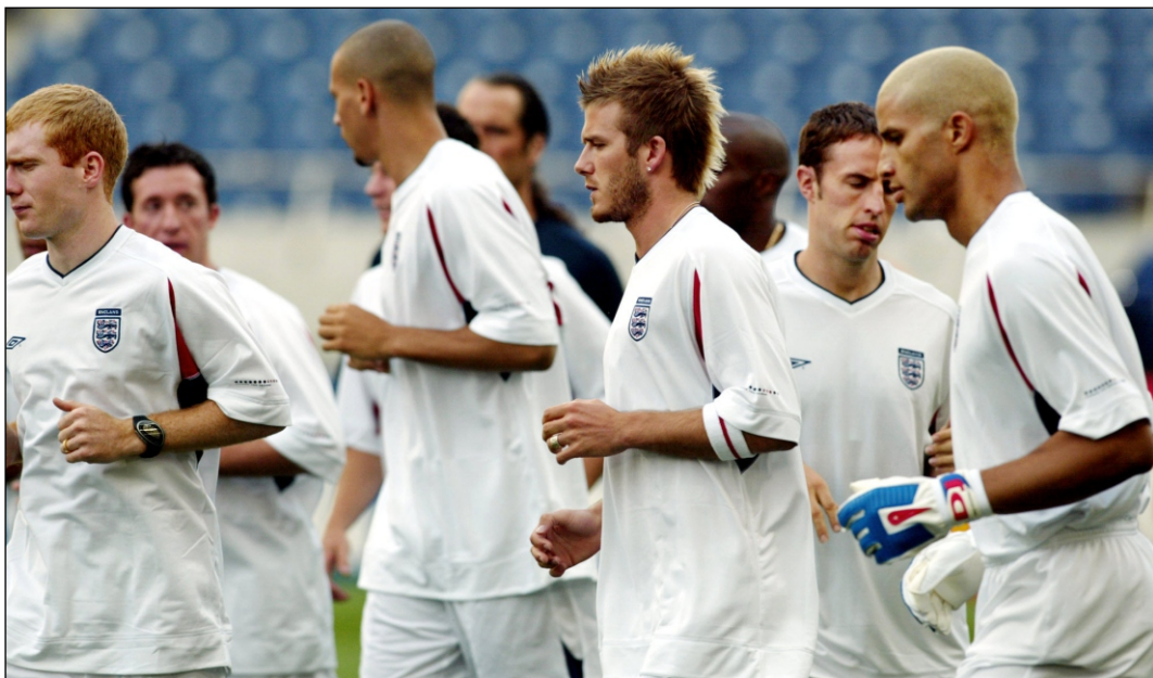
FIT IN TIME: David Beckham (C), warm-ups with his England teammates during a practice session at Saitama Stadium yesterday.