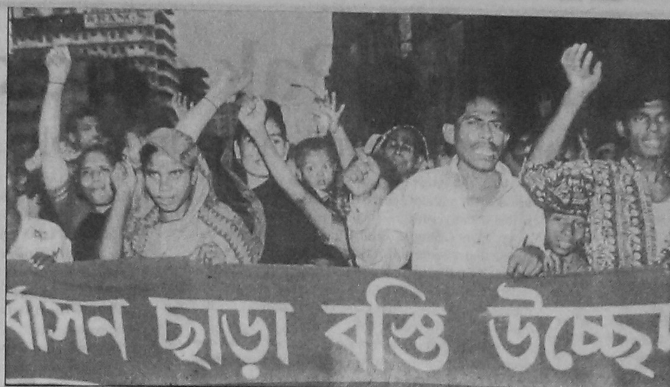
The slum-dwellers took to the street in the city yesterday protesting eviction of slum-dwellers without their rehabilitation.

A case was filed with Bogra Sadar Thana in this connection.