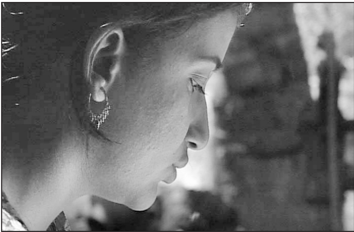
Relatively new artistes perform well in the film

Jahangirnagar Film Society screens free length film in the city