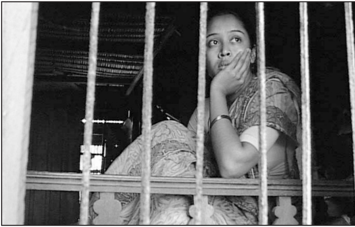
Scenes from the film show some central characters