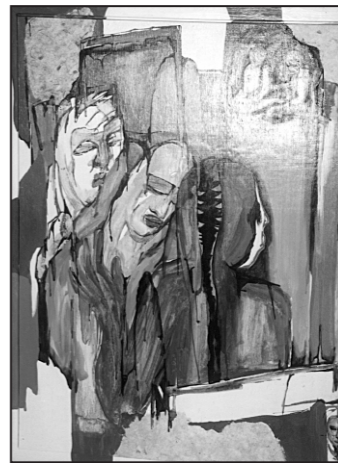
By Fariha Zeba

Faraha Zeba's present three women, once again groaning and contemplating with overt pessimism. The one in front, done in indigo, has her hand held up. Her face is in grotesque white, blue and red. There is another figure in painful orange and green and she appears to be pondering over the past. Behind her is yet another figure in dull and dismal gray and beige, pink, outlined with black. At