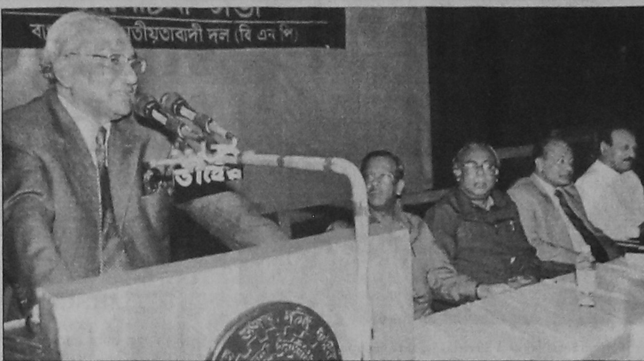
Finance Minister Saifur Rahman speaking at a discussion marking the 21st death anniversary of former president Ziaur Rahman. The BNP organised the discussion at the Engineers' Institute auditorium in the city yesterday.