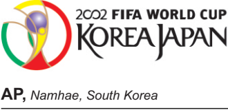
Namhae, South Korea