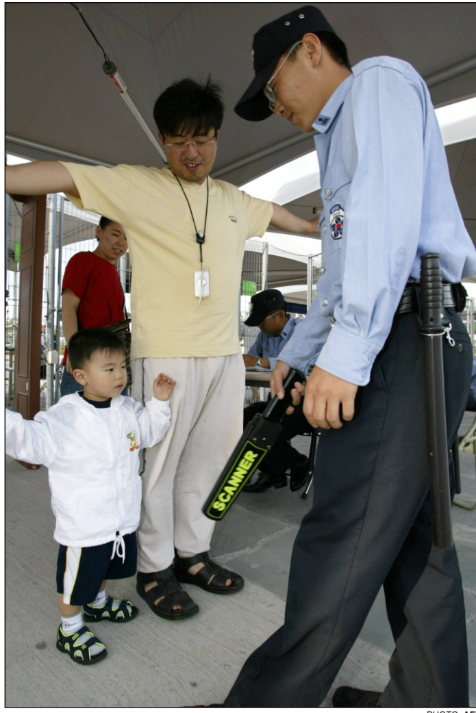
SECURITY SAME FOR EVERYONE! A South Korean child mimics his father as they go through a security check at the World Cup stadium in Seogwipo on May 25.