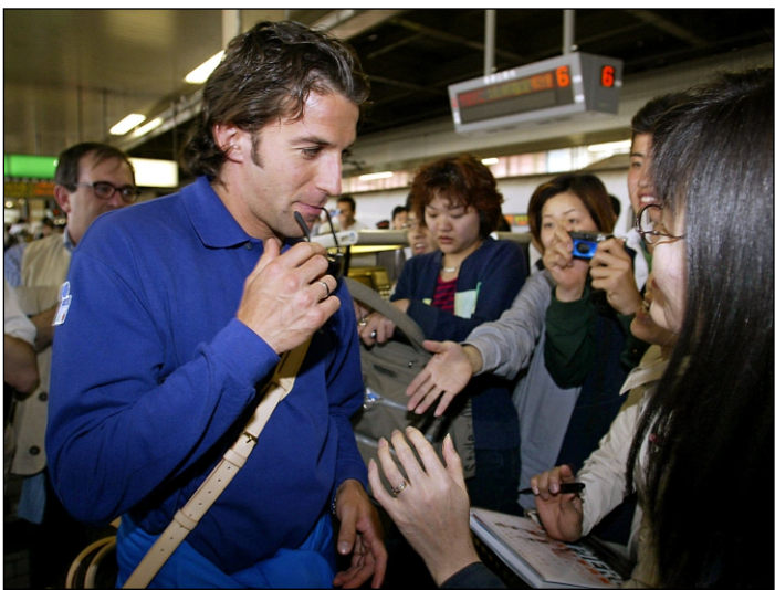
Star Italy striker Alessandro Del Piero sparing some time with her Japanese lady admirers on the platform of Sendai Railway station yesterday.

"I am thinking of buying some of them. They look cute and on top of that they're very commemorative. I will carefully choose one, maybe that purple one."