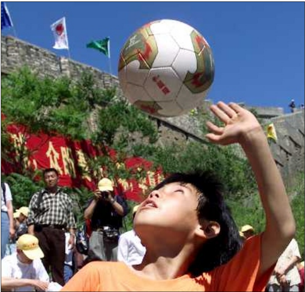
ON THE GREAT WALL: A Chinese boy pleases tourists with his ball-controlling prowess on the Jinshanling section of the Great Wall yesterday.