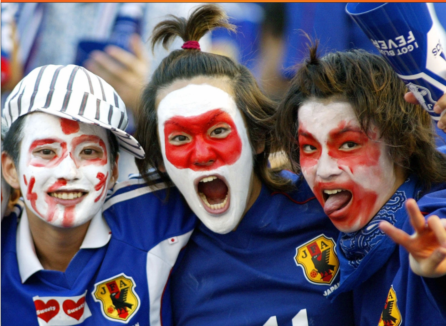
COLOURS OF THE RISING SUN: Fans, with their faces painted in Japanese colours, cheer their side on during the friendly match against Sweden in Tokyo yesterday.