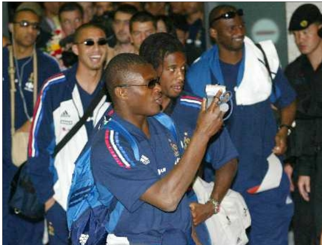
France captain Marcel Desailly (C), who is surrounded by his colleagues, records the reception accorded to them upon their arrival at the Incheon Airport yesterday.

The match will be their final warm-up before the defending champions kick-off their World Cup campaign here against Senegal on May 31.