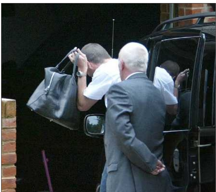
SHY OR ASHAMED? Roy Keane hides his face from inquisitive photographers as he steps out of his car in front of his house in Hale, Manchester yesterday.

Argentina has its final warmup Tuesday against Japanese club opposition. Two of the other favorites readied themselves Saturday for weekend tuneups.