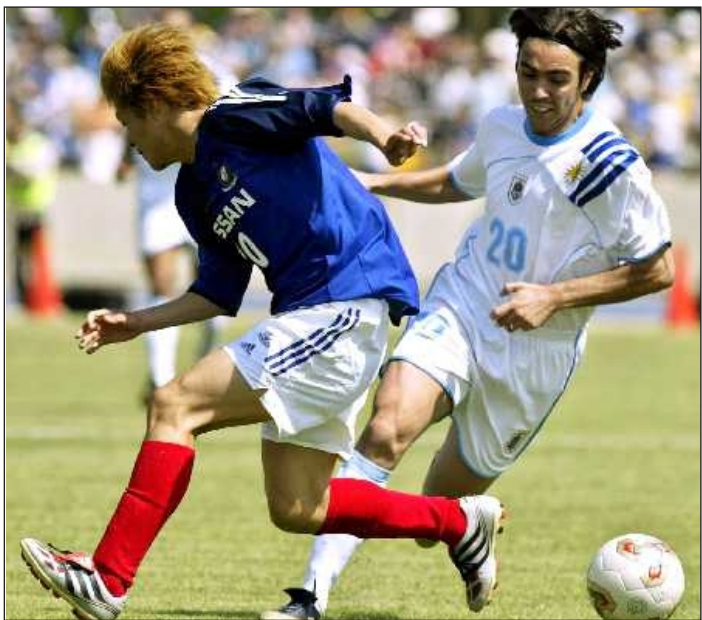
Uruguay star Alvaro Recoba (R) tries to go round Hayuma Tanaka of J-League side Yokohama Marinos during a practice game at Susono in Japan yesterday. The match ended 1-1