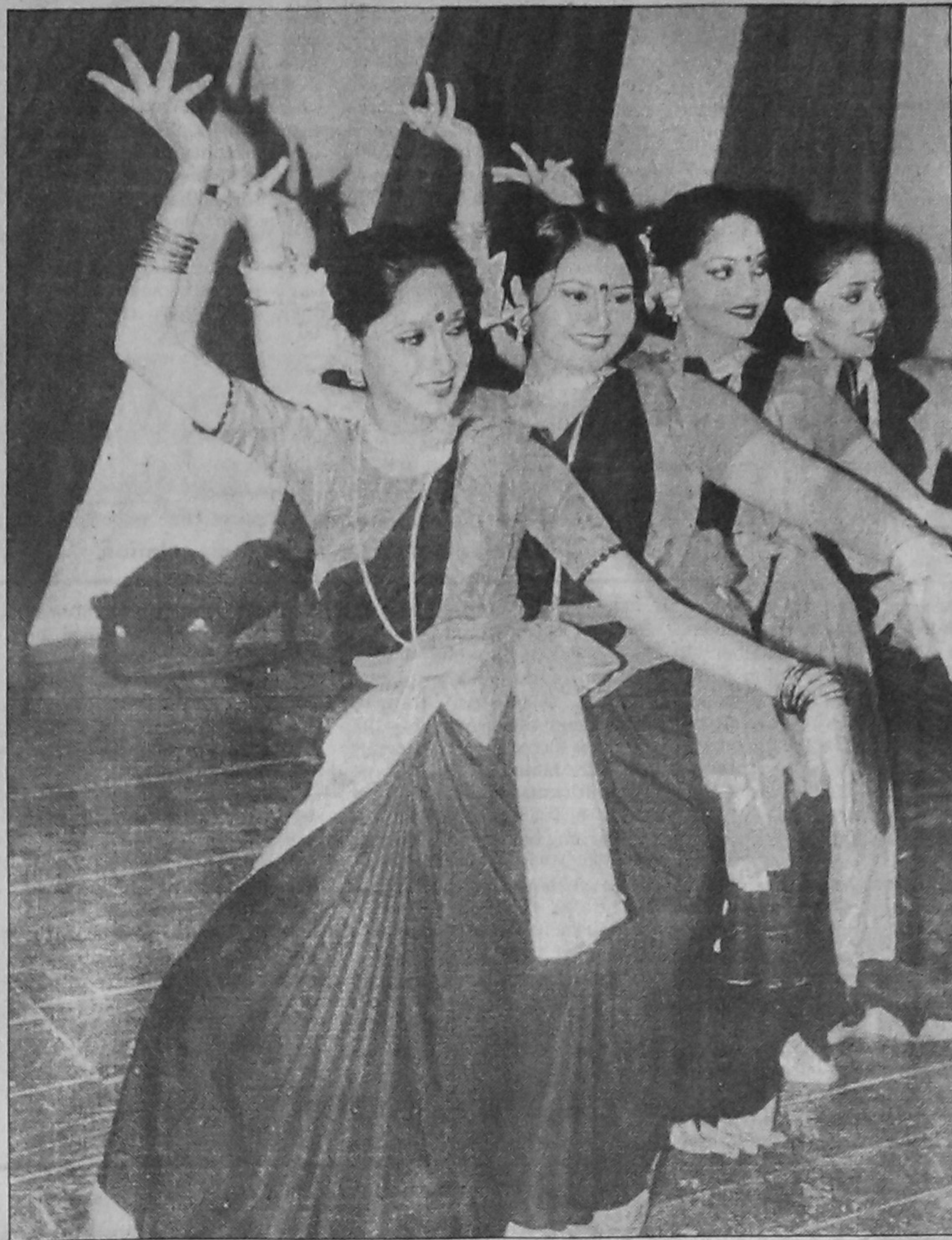
Girls performing a dance number at a function marking the 103rd birth anniversary of poet Kazi Nazrul Islam at the Shishu Academy auditorium in the city yesterday.

Acting on a secret information, police rushed to the spot and caught red-handed the 10 with two soil-loaded trucks.