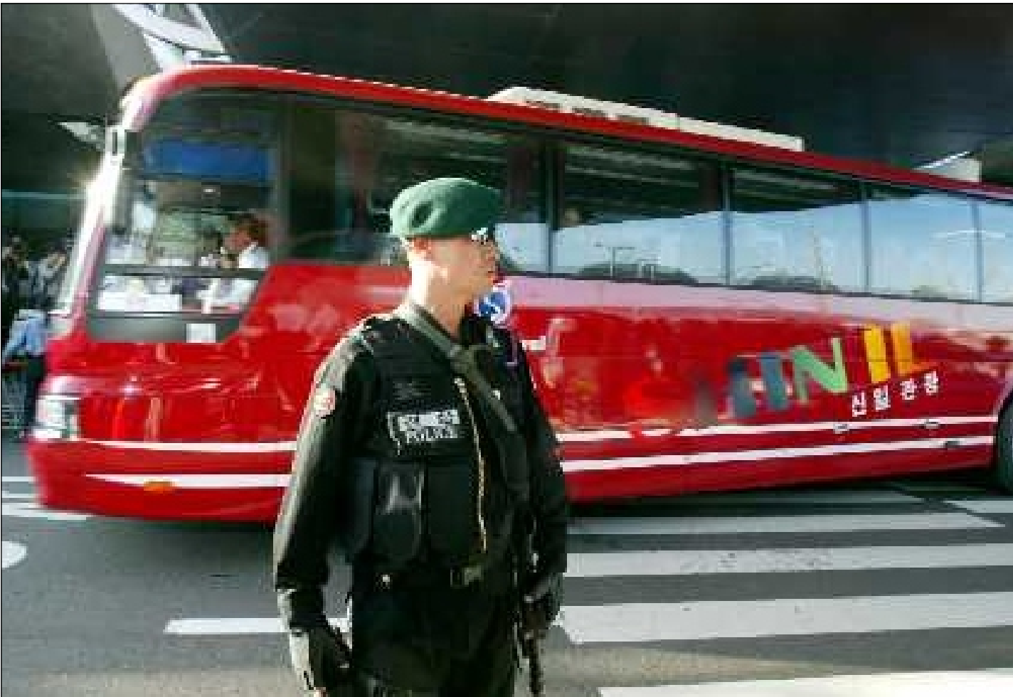
PHOTO: INTERNET SECURITY EXTRA TIGHT: A South Korean soldier stands watch as the bus carrying the USA squad heads for the team hotel outside the Incheon Airport near Seoul yesterday.