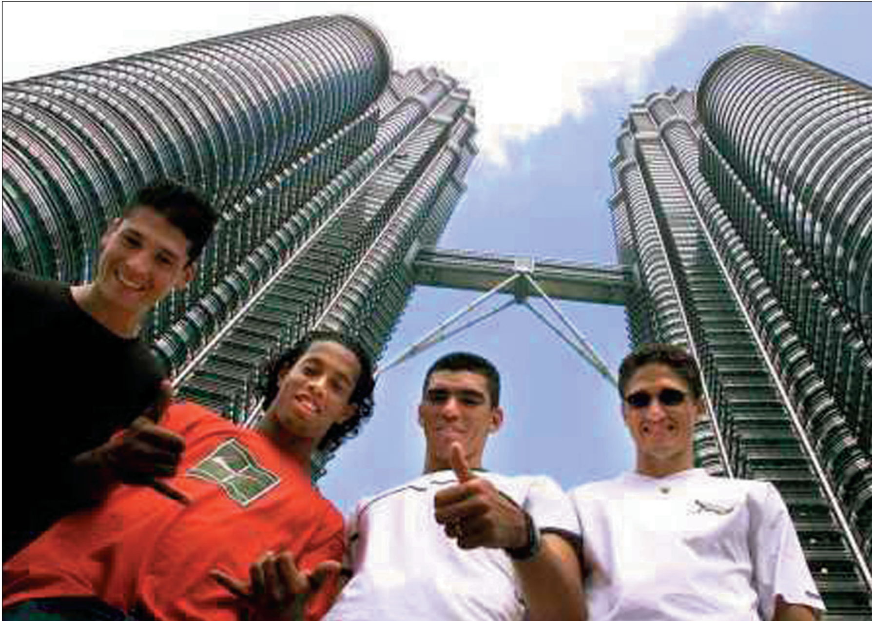
Brazil players (L-R) Anderson, Ronaldinho, Lucio and Edmilson take a picture in front of the world's tallest building Petronas Twin Towers while on the Kuala Lumpur-seeing tour yesterday.