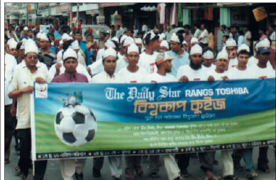
A colourful rally was brought out yesterday in Rajshahi on the eve of the draw ceremony for the third round of The Daily Star Rangs Toshiba World Cup quiz competition.