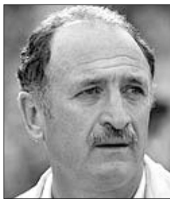
LUIZ FELIPE SCOLARI