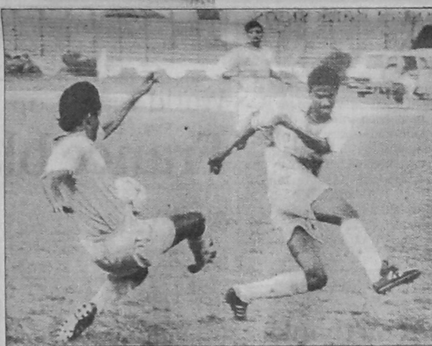
Action from yesterday's Nitol-Tata National Football League clash between two Abahanis - Dhaka and Chittagong - at the Bangabandhu National Stadium.