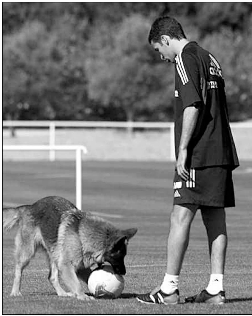
H H H

Veteran coach Milutinovic has talked long about instilling confidence into his team, but being unable to score against a side that finished second in the Dutch league bodes ill for their fate in a group also comprising Turkey and Brazil.