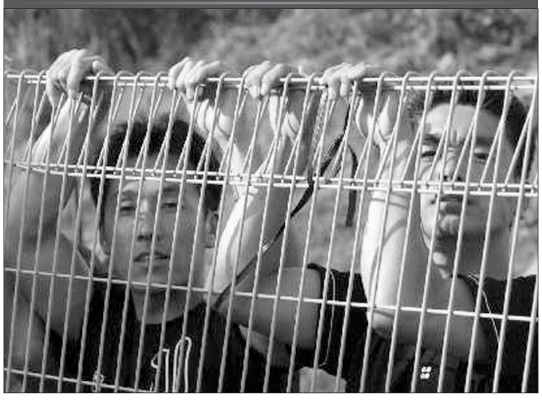
South Korean soccer fans watch England World Cup squad train at a ground in Soegwipo on Jeju Island yesterday.