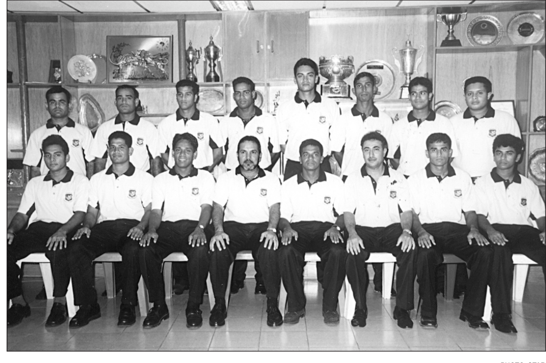
Members of the Malaysia-bound Bangladesh A cricket team who left here Saturday night to take part in a tri-nation tournament there. The second string national side take on the United States in their opening match today.