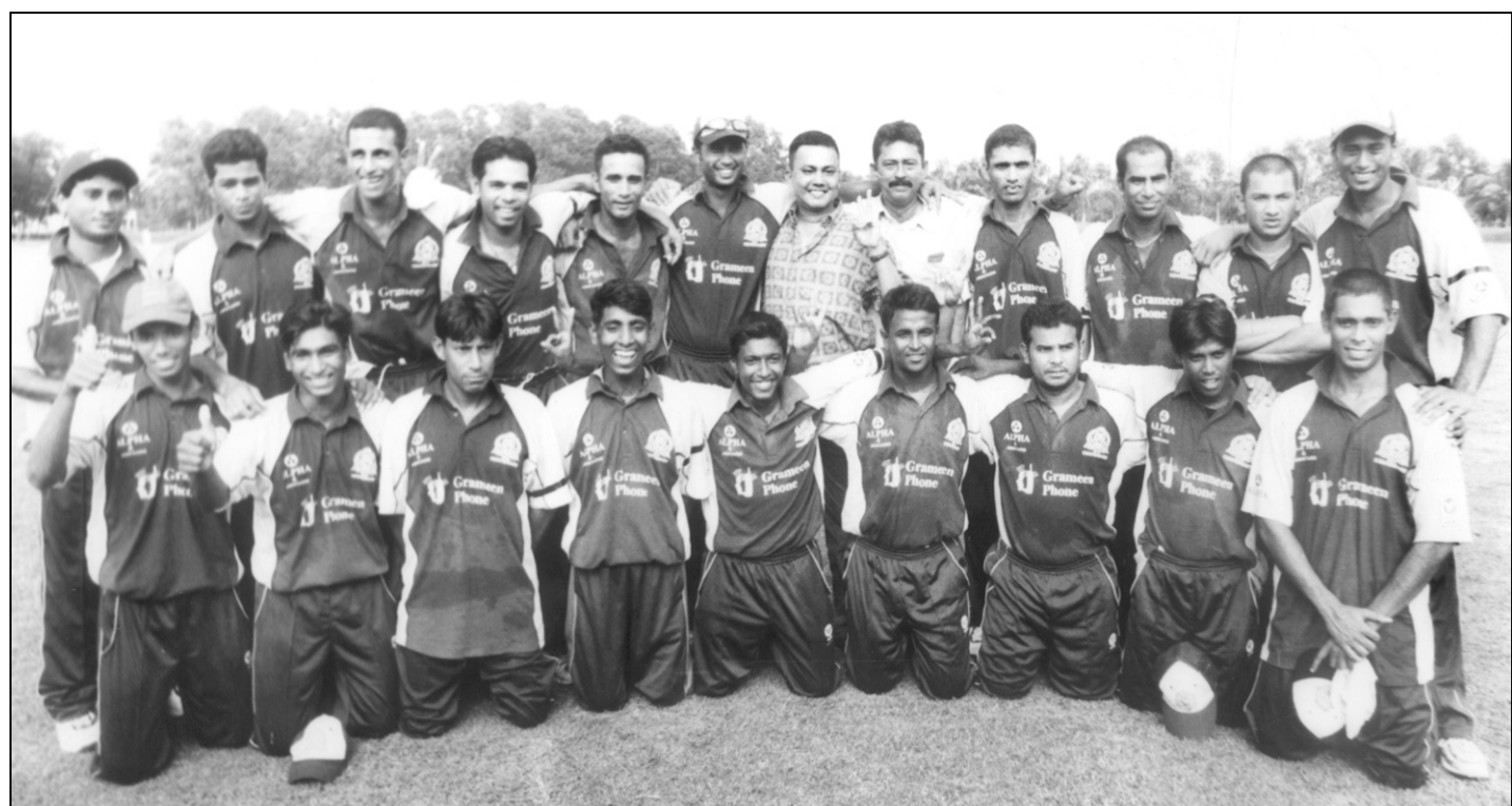
CONGRATULATIONS: Players and officials of the Victoria Sporting Club pose for photographers after they became GrameenPhone Premier Division Cricket League champions on Friday.

that marred England's efforts in the field. Both Fernando and left-arm quick Chaminda Vaas settled into a testing line and length with conditions assisting swing bowling.