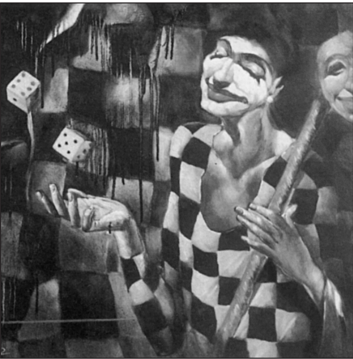
The King Maker / Sukanta Das

The exhibition is open to all from 2 p.m. to 8 p.m. daily till May 22.