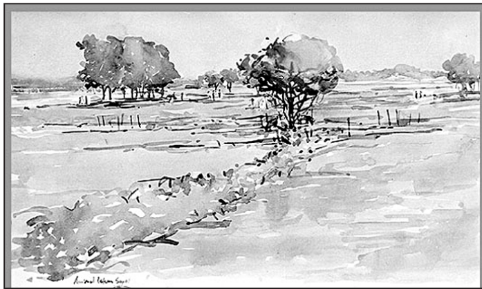
'Landscape on dry time'

All the watercolours of A Farewell to Home Town were done during his visits in Mymensingh in March 2000 and in April 2002. The realistic landscapes, identical in subject matter and treatment, share the same title -- Landscape on dry time as they depict the scenario of a particular season. The pieces were created to share some of the artist's intimate moments -- true and simple. So