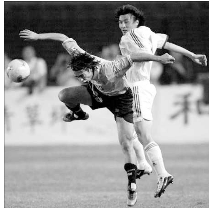
Uruguay's Alvaro Recoba (L) loses his balance while fighting for the ball with China's Li Weifeng during their pre-World Cup warm-up match in Shenyang, capital of China's northeastern province of Liaoning, on May 16.

cross from Jason McAteer on the right flank found the Leeds United striker unmarked on the edge of the six yard box, but his header was misdirected and passed wide of Shorunmu's left hand post. Barely a minute into the second half Nigeria were further in front. Lax marking at a corner gave Sodje a free header at the back post, and the right-back made no mistake. As the second half wore on McCarthy made a string of substitutions, and his side struggled to find fluency. But it was one of the replacements, Millwalls's Reid, who gave the Irish some hope in the 68th minute, cutting in from the right flank and dancing through the Nigerian defence before unleashing a left footed shot into the top corner of the goal. Ireland continued to press, and three minutes from the end another substitute, Charlton midfielder Kinsella found the net, only to see the goal ruled out by the Portuguese referee for offside. McCarthy said: "We had chance after chance. I think we deserved an equaliser. We should have won that game. Overall I'm very pleased with the performance but disappointed with the result. "Hopefully, we can play as well as that in the World Cup and get results." Ireland face African Nations Cup winners Cameroon as well as Germany and Saudi Arabia in group E. "It's shown us that Cameroon aren't (going to be) any mugs. I think they are better than Nigeria," said McCarthy. Nigeria are drawn in Group F, along with Argentina, England and Sweden