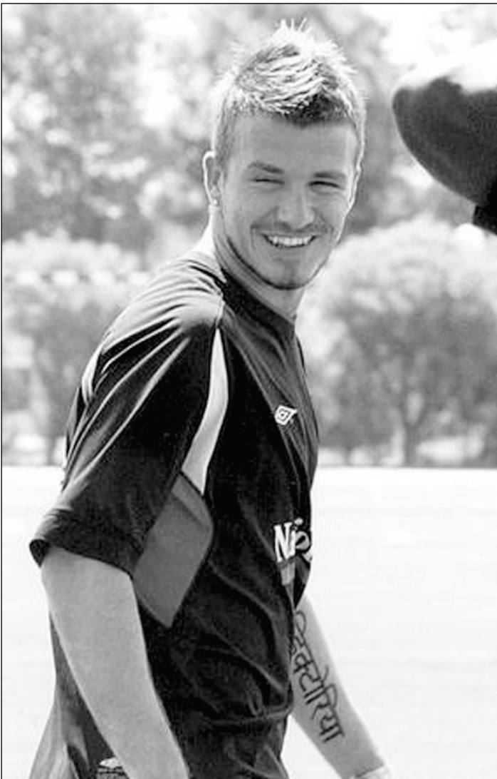
BECK IS BACK: A smiling England captain David Beckham takes to the field at the Dubai Police Club yesterday. (Can you spot 'Victoria' inscribed in Hindi on his left hand?)

England have been boosted by David Beckham and Nicky Butt's return to training this morning. The Manchester United duo hadn't taken any part in the training sessions at their camp in Dubai as they recovered from injuries. Beckham is recovering from a broken bone in his foot, but he showed very encouraging signs that he will be available for selection in England's first match against Sweden on June 2. However it isn't all good news as Arsenal defender Sol Campbell sat out of training once again as he continues to recover from a gash in his leg that required eight stitches.