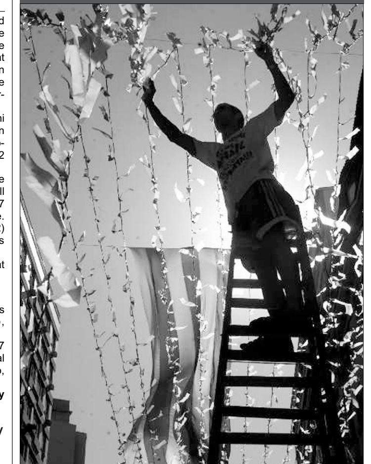
A resident of a Rio de Janeiro neighbourhood decorates the surroundings of his house with yellow and green flags on May 16 to celebrate the upcoming World Cup.