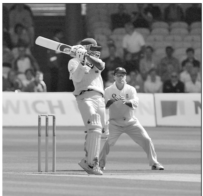
Sri Lanka skipper Sanath Jayasuriya follows through on a square cut during his short innings on the opening day of the first Test against England at Lord's yesterday.