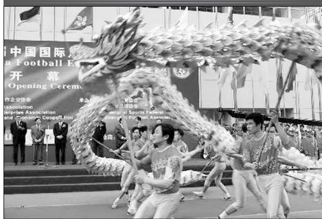
Chinese dragon-dancers perform during the opening ceremony of the China International Football Expo in Shanghai yesterday. The Chinese soccer team is preparing for its first ever World Cup tournament after a 44-year wait, with the nation currently in the grip of a soccer fever.