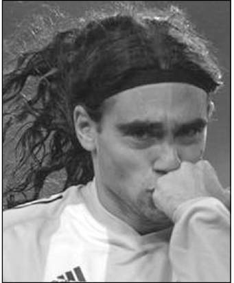
JUAN PABLO SORIN

"It doesn't work like that, you have got to be all up for it."