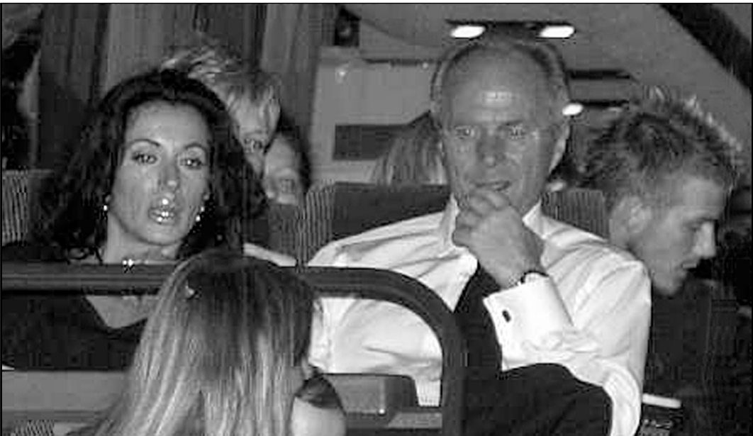
England manager Sven Goran Eriksson, accompanied by his girlfriend Nancy Dell'Olio, sits on the team bus before departing Dubai Airport for a hotel on May 14.

REUTERS, London Real Madrid midfielder Steve McManaman learned of his omission from England's World Cup squad through a message left on his mobile phone. In an article published in Wednesday's Daily Telegraph McManaman, who has played 37 times for his country, said England coach Sven-Goran Eriksson had made it clear he was not part of his World Cup plans. "If this is the end of my international career then it is a very sad end just to have a message left on my mobile phone while I was training on the morning the squad was announced," McManaman wrote. "I can't say I was completely surprised after not being contacted for any of the last three or four squads but then you always hope."