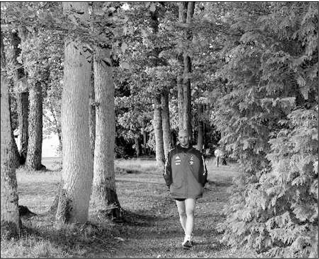
BARTHEZ 'WOODS' France goalkeeper Fabien Barthez walks through a forest by the national team's training centre at Clairefontaine near Paris on May 14.