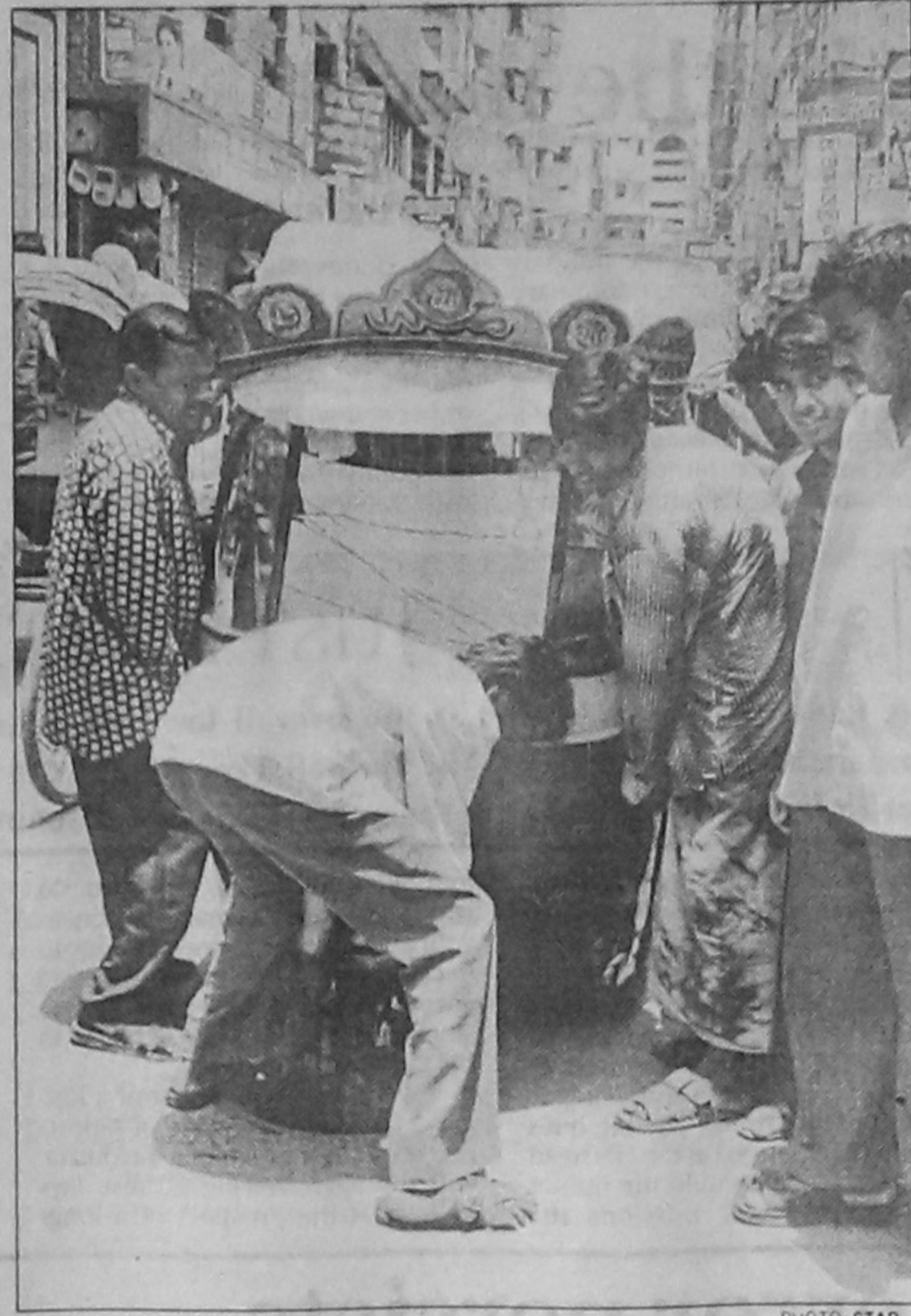
The covers of most manholes at the Maghbazar Masjid Lane have been stolen but the authorities are indifferent to the suffering of the road users. Photo shows local people trying to lift an autorickshaw after one of its wheels got stuck in a manhole.

It added that the RSF would shortly publish a report on its March 3-10 fact-finding mission to Bangladesh.