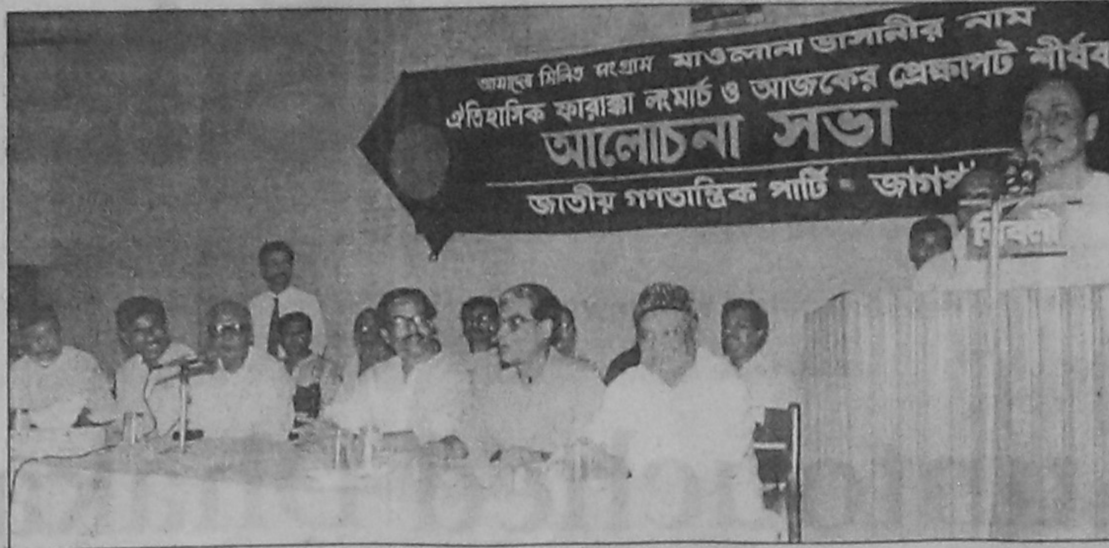
Jatiya Party Chairman HM Ershad speaking at a discussion on 'Historic Farakka Long March', organised by the Jatiya Ganatantrik Party, at the National Press Club in the city yesterday.