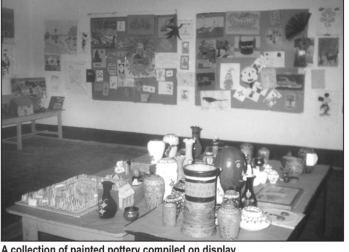
A collection of painted pottery compiled on display