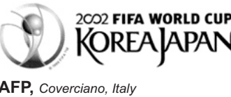
Coverciano, Italy

Italy coach Giovanni Trapattoni on Monday definitively closed the book on the Roberto Baggio debate as the 'Azzurri' began their preparation for the World Cup here at the National Technical Centre near Florence.