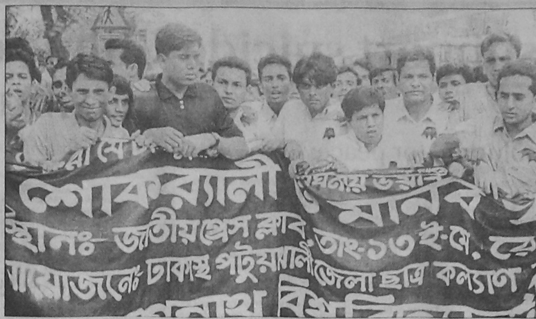
The Patuakhali Zila Chhatra Kalyan Samity brought out a mourning procession in the city yesterday in memory of the victims of recent launch disaster.

The fair will remain open for all from 10 in the morning till 7-30 in the evening till May 18.