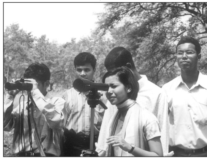
Enthusiastic students of Rajshahi University watch birds at the fair

A slide show on birds was screened at the later half of the day with narration from Enam Ul Haq