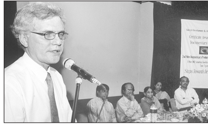
The Ambassador of Sweden addresses, in praise of Steps' activities