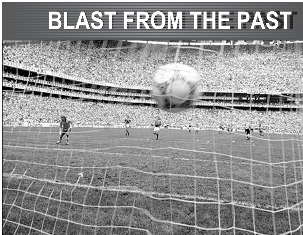
Jorge Burruchaga (not in the picture), put through by Diego Maradona, just manages to beat the offside trap and goes on to fire past German custodian Harald Schumacher to score the Argentina's winning goal in 1986 FIFA World Cup final at Mexico's Azteca Stadium. Argentina won 3-2