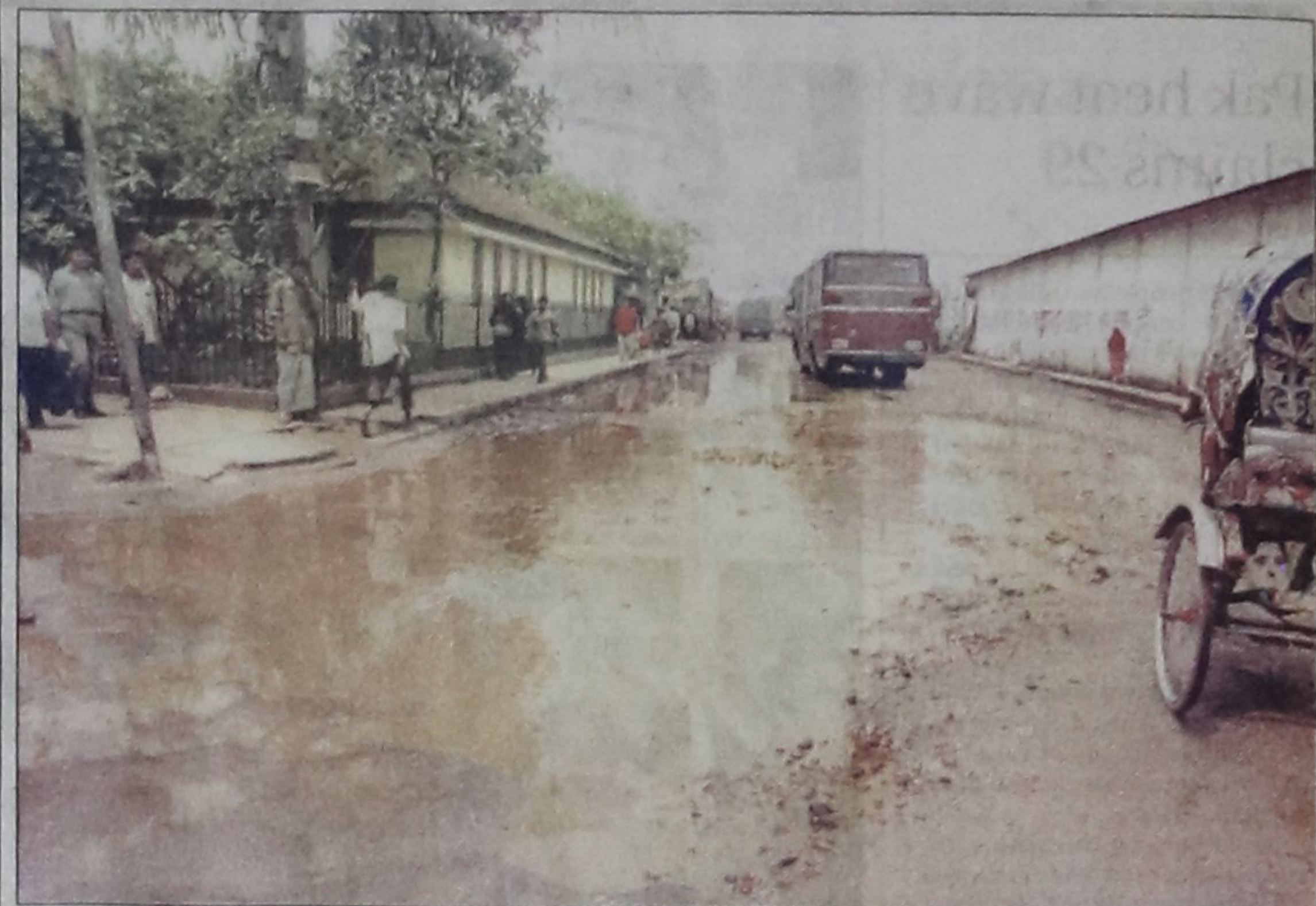
This road near the Sayedabad Bus Terminal is in a very bad shape. Potholes filled with rainwater make it all the more difficult for the road users.