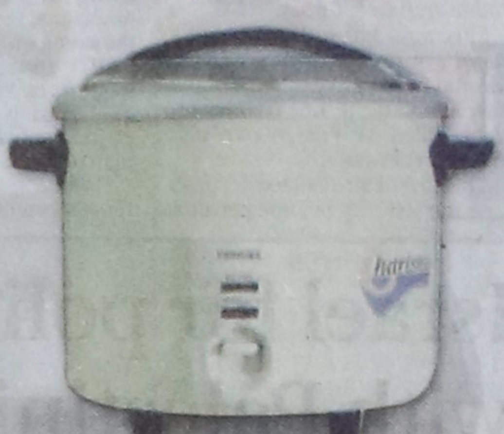
TOSHIBA RICE COOKER