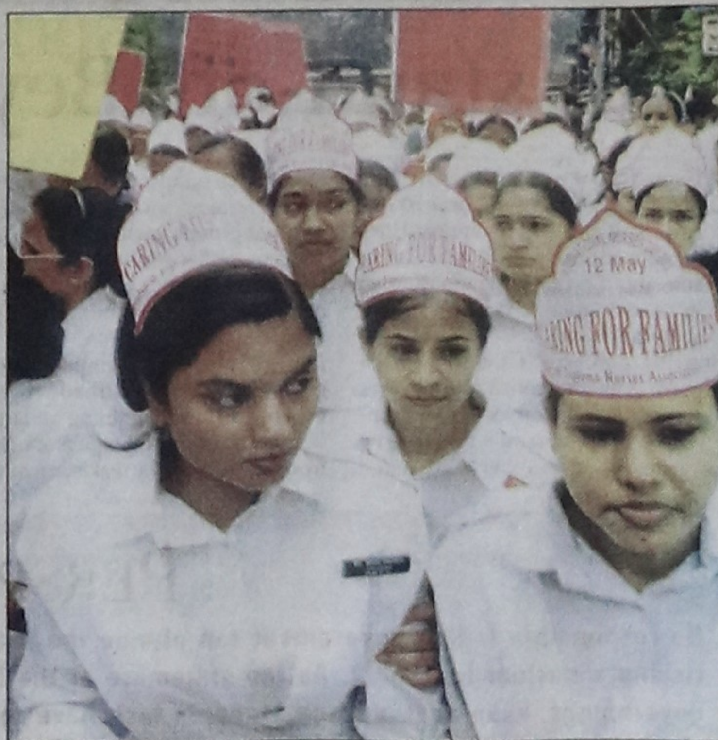
The Bangladesh Diploma Nurses' Association brought out a procession in the city yesterday to mark the International Nurses Day.

The Indian Prime Minister conveyed his deepest sympathies for the bereaved families.