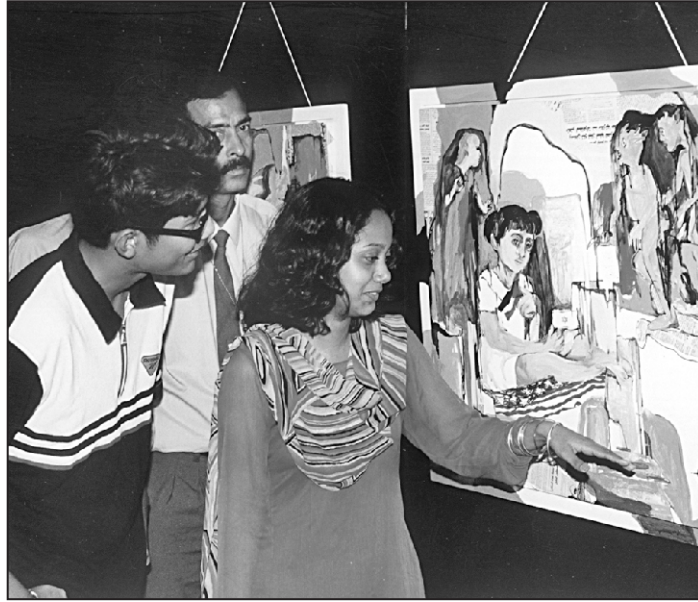
Viewers have a glimpse of the displayed works on the opening day

The canvases contain snapshots of contemporary Bangladesh. The city life with all its grimy, gloomy, and terrifying aspects, juxtaposed with the soothing glimpses of crafts impregnate with age-old tradition and heritage.