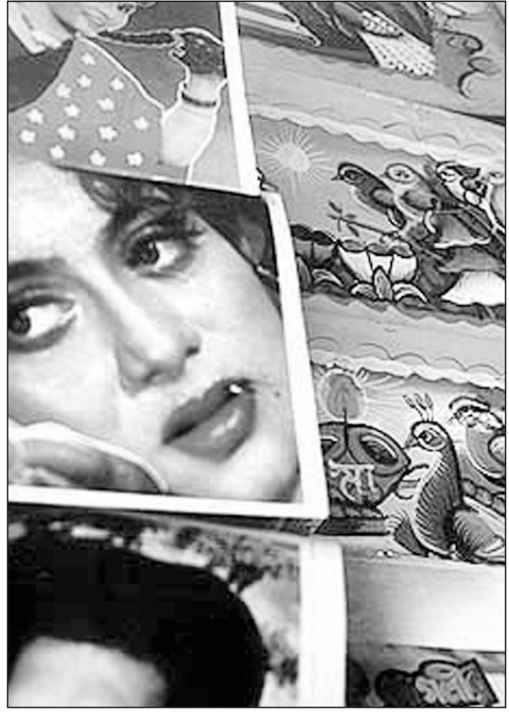
Portraits of film actresses and other colourful images of birds, animals, etc find place on back-plate of rickshaw seat