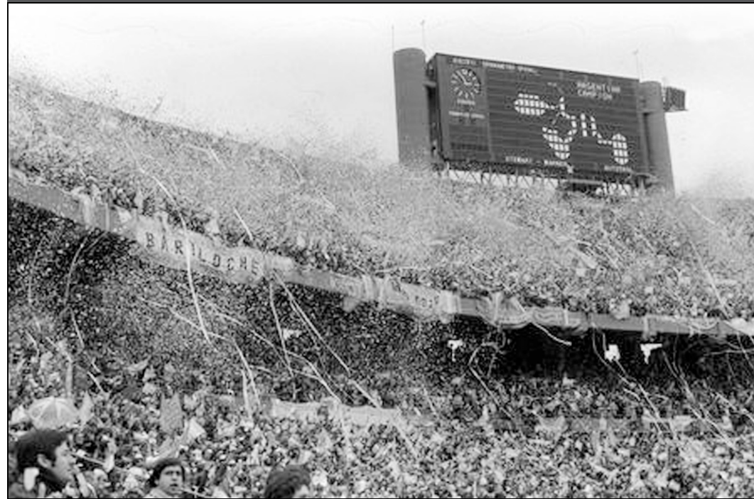
The 71,483 fans present at River Plate's stadium in Buenos Aires manifest their boundless excitement at the end of the 1978 World Cup final between Argentina and Holland which the home team one 3-1. The celebrations amid the oceans of banners and streamers is understandable-- This is the Argentina's first World Cup title.