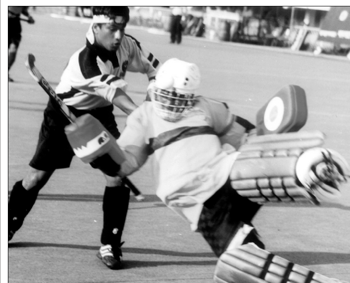
Mariner Youngs custodian foils a Kamal attack during their Green Delta Premier Division Hockey League encounter at the Maulana Bhasani National Stadium yesterday.