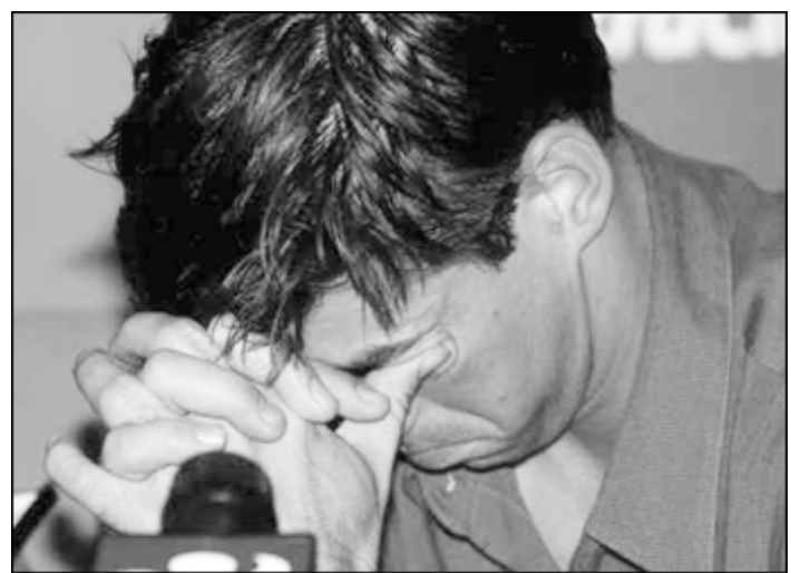
New Zealand captain Stephen Fleming fights to hold back his tears during a press conference in Auckland yesterday.