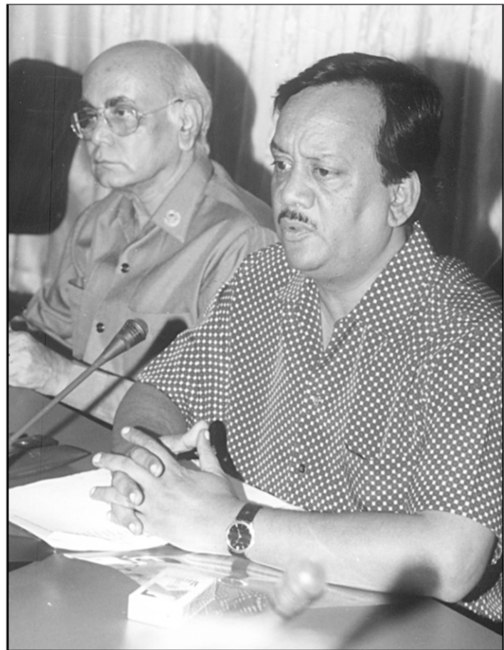
State Minister for Youth and Sports Fazlur Rahman talking to sports reporters at the National Sports Council yesterday.

Mosharraf, who lost his post of BSF general secretary a few months back following a court