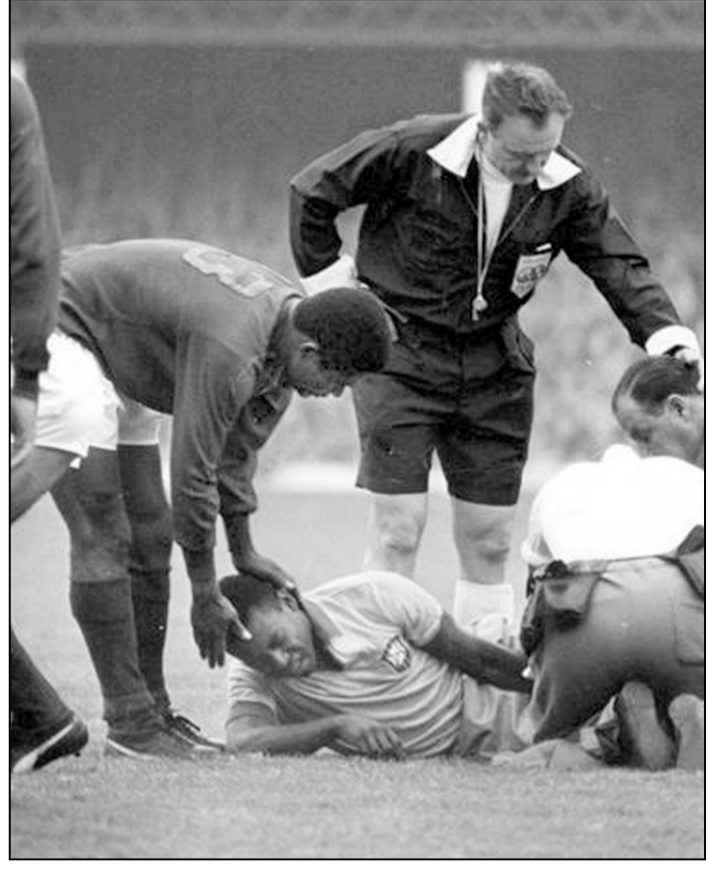
GREAT FEELS FOR THE GREATEST: Portuguese superstar Eusebio consoles the legendary Pele (on the ground) of Brazil who is in tremendous pain after being tackled by a Portuguese defender during their clash at the 1966 FIFA World Cup finals. Just as in 1962, Pele would not stay the distance in this World Cup, after being badly affected by repeated fouls from defenders, the main culprits being Bulgaria and Portugal. Portugal won this group match (3-1) and Brazil exited the competition in the first round.