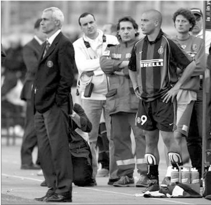
STARING AT DOOM: Inter's coach Hector Cuper (L) and Brazilian superstar Ronaldo feel the title slipping away at Rome on May 5

Inter president Massimo Moratti told Stream TV: "It's a bitter disappointment - what can I say? But the players could have done more. We did not deserve this over the season but we did on the day."