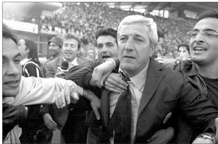
Marcello Lippi (C), the Juventus coach is the toast of ecstatic fans at the end of the match against Udinese in Udine on May 5.

When Inter took the lead Moratti was seen to make a sign of the cross in the VIP area at the Olympic Stadium but his prayers in the Eternal City were not answered as Lazio - despite the exhortations of their fans who were openly supporting Inter to stop rivals Roma - came back to win.