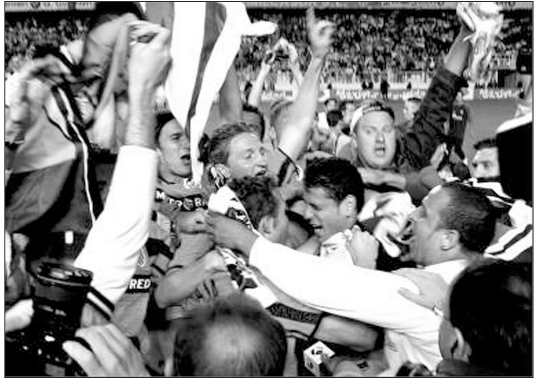
A MOMENT TO SAVOUR: Valencia players and fans celebrate in Malaga on May 4 after championship was ensured.

After their defeat, Zaragoza players had to flee for the safety of