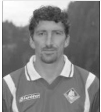
DARIO HUBNER finished fourth and fill the last place in

TOP SCORERS (Italian unless stated) 24 goals - David Trezeguet (Juventus/Fra), Dario Hubner (Piacenza) 22 goals - Christian Vieri (Inter Milan) 20 goals - Marco Di Vaio (Parma) 18 goals - Filippo Maniero (Venezia) 16 goals - Cristiano Doni (Atalanta), Alessandro Del Piero (Juventus)