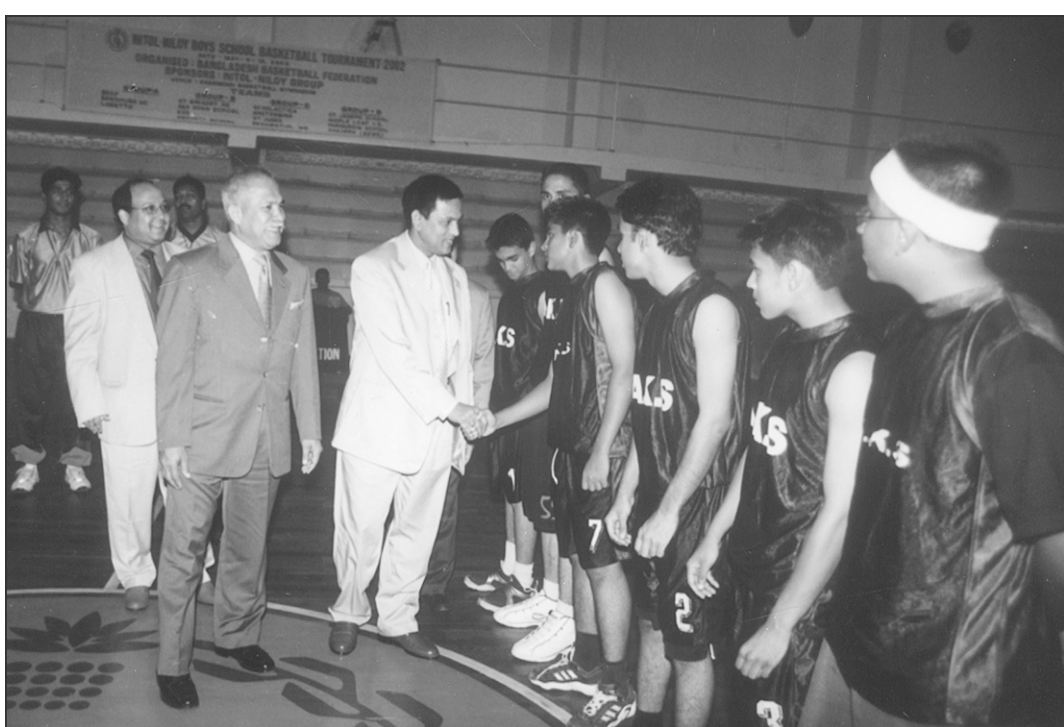
State Minister for Education AMN Ehsanul Huq shakes hands with the players prior to the start of the Nitol-Niloy Boys School Basketball tournament yesterday.

ACROSS 1 Swab 4 Cool 7 Unclear 12 Like-minded 13 Environmentally friendly 14 South-western brick 15 Caused corrosion 16 Water storage area 18 Calendar abbr. 19 Manicurist's item 20 Detail, for short 22 Hubbub 23 Persian ruler 27 Botanical blight 29 Type of dance 31 Illinois city 34 Hypnotized 35 Maintenance 37 Daily show host Stewart