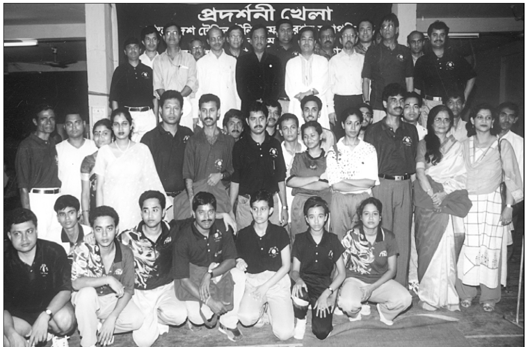
Players and officials of both Tripura Table Tennis Club and Bangladesh Table Tennis Federation President's Team pose for photographers along with State Minister for Youth and Sports Fazlur Rahman after the friendly matches at the NSC yesterday.