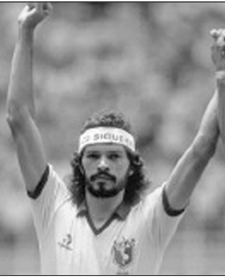
Socrates (Former Brazil soccer captain) "Football became popular because it was considered an art, but now too many pitches are becoming battlefields."