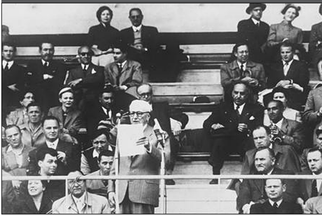
Just before the opening match of the 1954 FIFA World Cup in Lausanne between France and Yugoslavia (0-1), 81-year-old FIFA chairman and event creator Jules Rimet officially opens the tournament. The 1954 finals in Switzerland was to be his last. On June 21 of the same year, Rimet completed his term of office and became FIFA's first honorary chairman. He passed away in 1956.