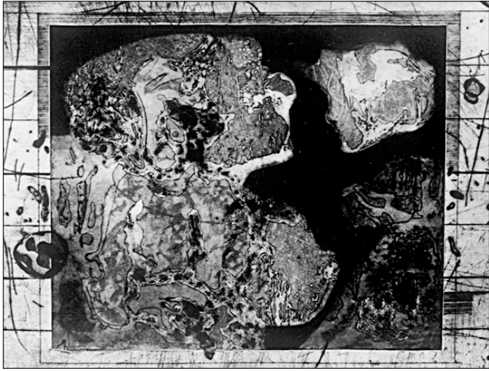
Vibration of Moon, mixed media

pale in colour and she has an amulet about her neck. There is a suggestion of a face of a man who is following her and around her are geometrical motifs that enhance the beauty of the composition. There is yet another composition that deals with fear. We find a good looking woman with chiseled features almost like that of a Greek statue. Around her are lines and forms in gray and black. At the side is her worried profile with twisted lips, waiting with apprehension.