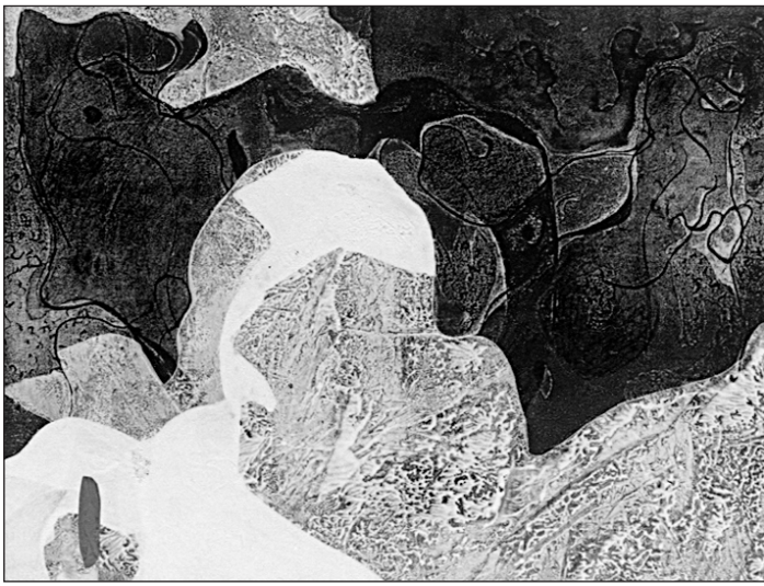
From 'Dream' series, mixed media