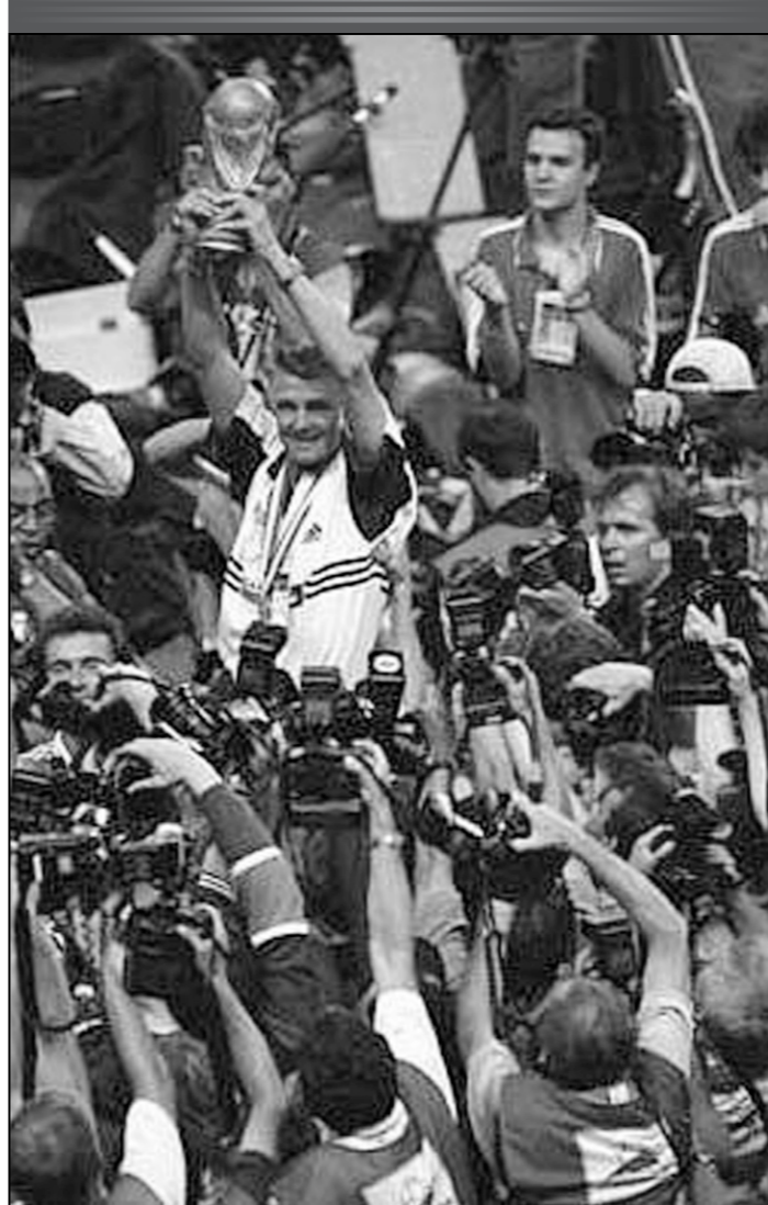
A proud France coach Aime Jacquet holds aloft the World Cup as he is surrounded by photographers after the final against Brazil at the Stade de France in St Denis on July 12, 1998. After semifinal win Jacquet stated: "Nothing can stop us now." It was the first ever final for France as three times in previous tournaments their way was blocked in the semifinal stage. The hosts won the final 3-0 and they became the first team since 1970 to win the Cup without losing a match.