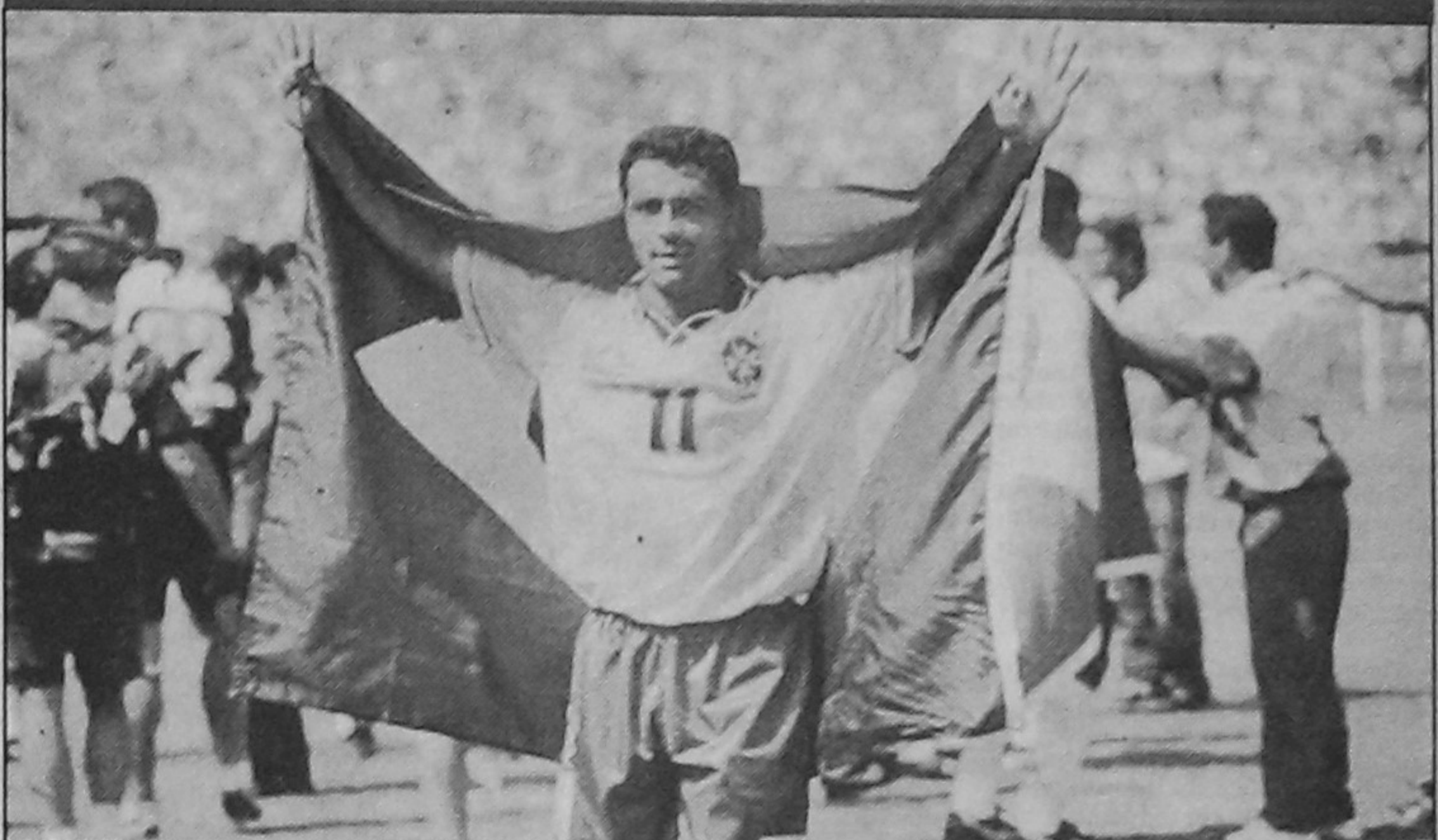
Romario, wrapped in Brazilian colours, after the 1994 FIFA World Cup final triumph against Italy. Brazil became the first team to win World Cup four times. Romario was the Most Valuable Player of the tournament and netted five goals in seven matches.