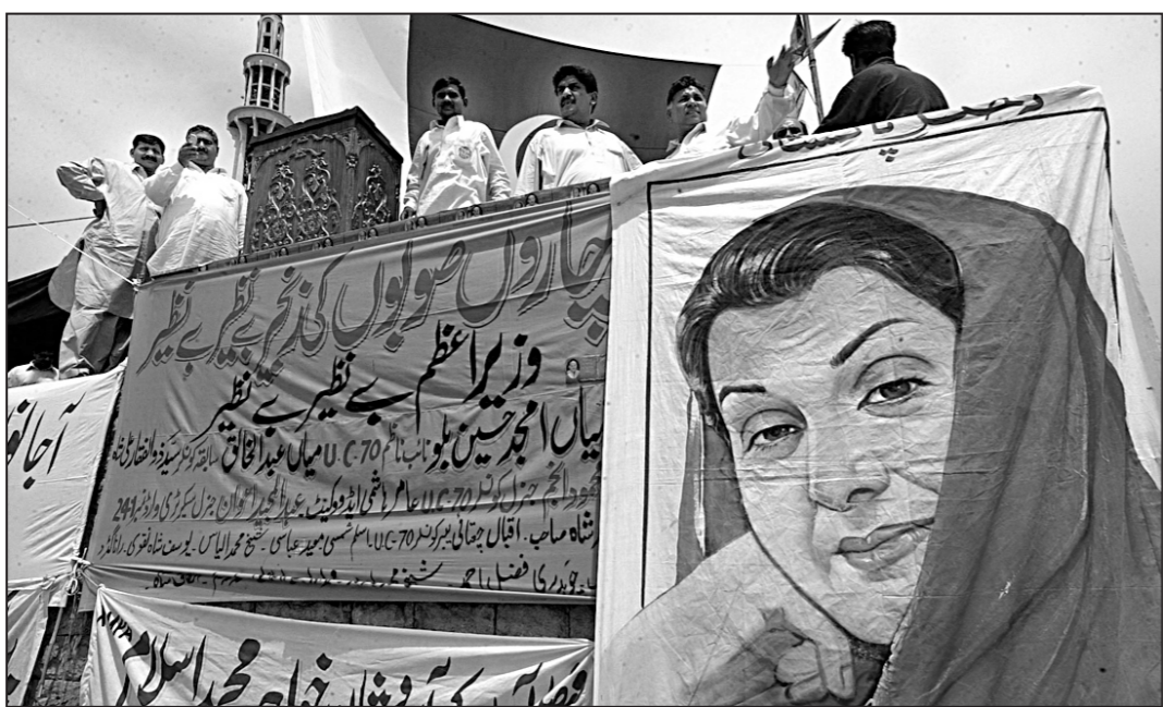
Activists from opposition parties of Pakistan make final preparations for a public meeting against the President General Pervez Musharraf's referendum in Lahore on Saturday. A group of opposition party Alliance of Restoration of Democracy (ARD) is holding a public meeting to mobilise people against the forthcoming presidential referendum.

AFP, Karachi The United States has invited Pakistani airport staff to attend a crisis management training programme to help them cope with hijack situations, a senior aviation official said Saturday.