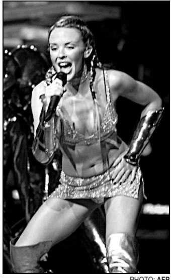
Australian popstar Kylie Minogue performs at her European tour opening concert in Cardiff on Friday.

AFP, Kalamata A Greek court found a group of British and Dutch "plane-spotters" guilty of espionage Friday, handing them sentences of between one and three years for snooping on Greek military bases.