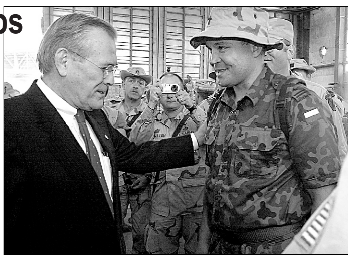
US Defence Secretary Donald Rumsfeld (L) pats an unidentified member of the allied force at the air base in Bagram on Saturday. Rumsfeld is on a day-long visit to Afghanistan to meet senior Afghan leaders and US troops.

stationed at this former Soviet base. "When this war is won, and it will be won, you will be able to say that 'I fought with the coalition in Afghanistan against terrorism' and you will be remembered for it."